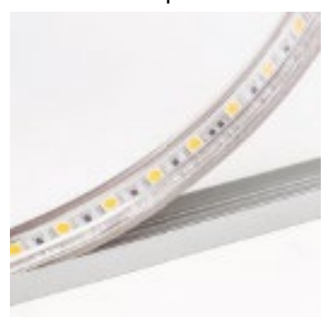
3: Strip (for temporary use)